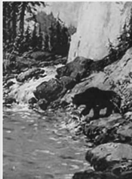
Bear, oil on board, 12 x 14 inches, signed. Published on cover of Outdoor America, September 1931.