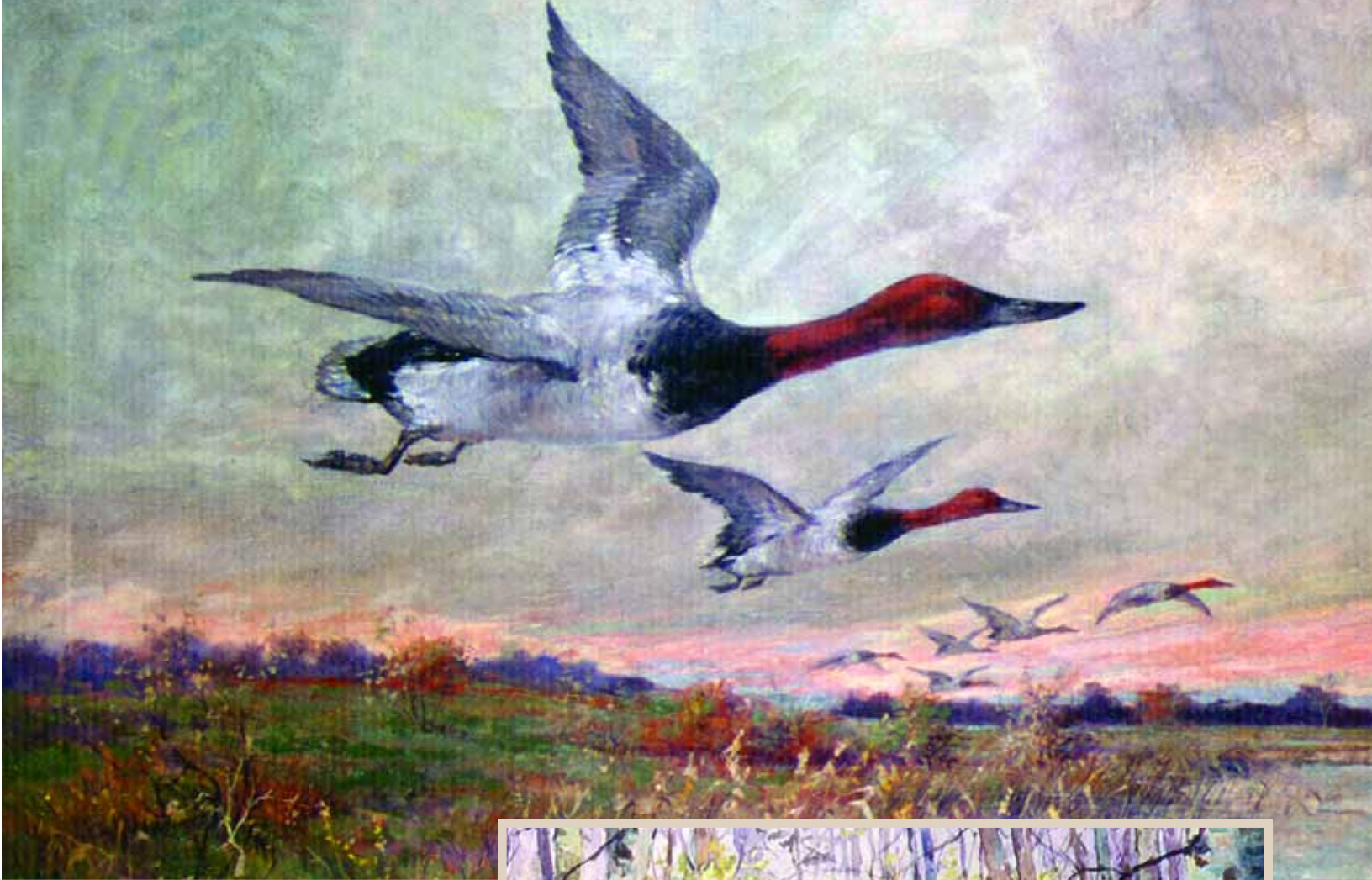
Canvasbacks over Rousseau Lake, Princeton Game & Fish Club, Bureau County, Illinois, oil on canvas, 30 x 20 inches, signed, ca. 1911. AT RIGHT: Tom Turkey and his Harem, oil on board, 12 x 18 inches, signed, ca. 1920.

T HIS INTRODUCTION by Fish Berg for the 1921 exhibition of 24 paintings by William Schmedtgen at Young Art Galleries in Chicago depicts a familiar picture of a man burdened by an unfulfilling occupation infused with stress. Fortunately fate intervened, and this weary artist found an escape among nature, not as a hunter but as a painter, able to immerse within the beauty of the wildlife he found there and observantly apply that vision to canvas.