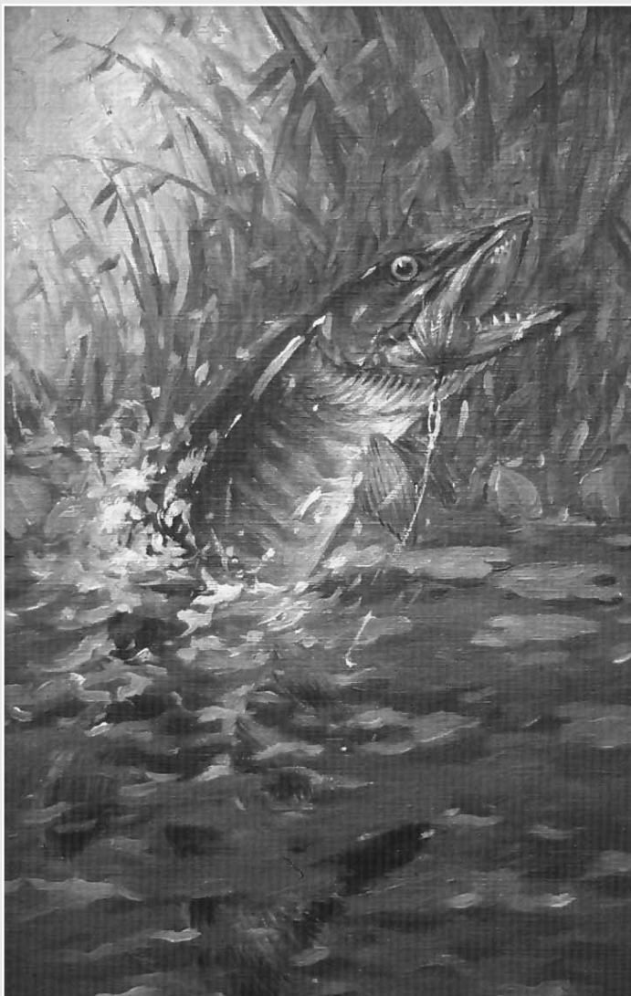
Jumping Northern, oil on board, 10½ x 18 inches, signed, ca. 1930.