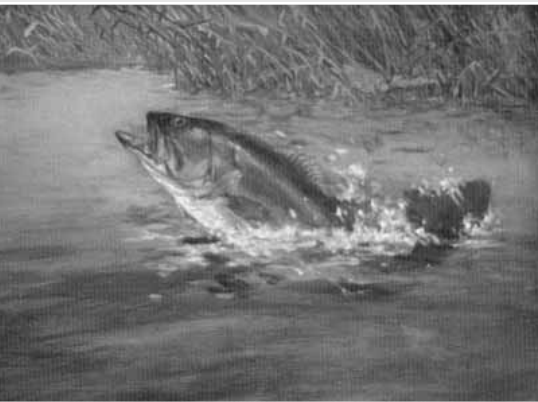
Bass Jumping, oil on canvas, 24 x 18 inches, signed, ca. 1930.